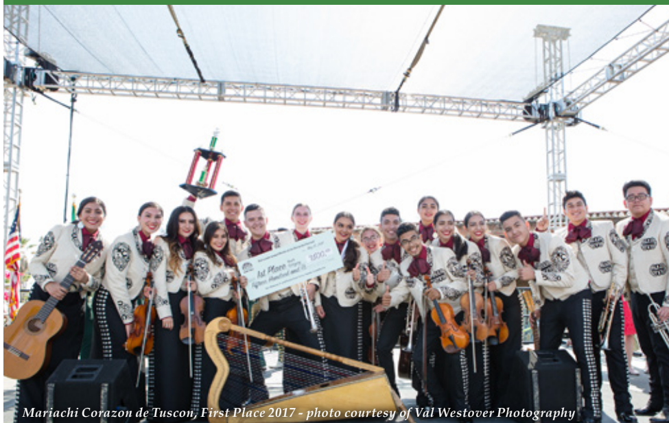
Mariachi Corazon de Tuscon, First Place 2017 - photo courtesy of Val Westover Photography