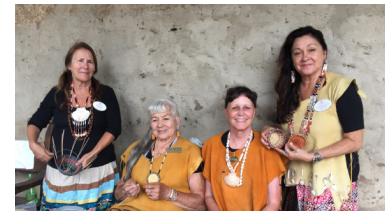
Native American Basket Weavers