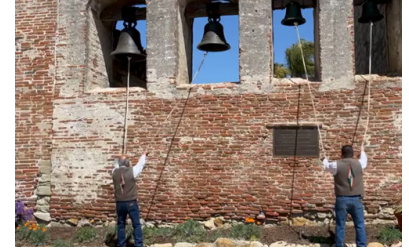
Ringing of the Historic Bells

In Honor of St. Joseph and the Swallows Return