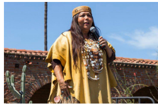
Journeys to the Past