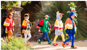
Mission Basilica School Performances

Learn about Mission history at the Serra Chapel, Ruins of the Great Stone Church, the Padres Bedroom and the Industrial Area.