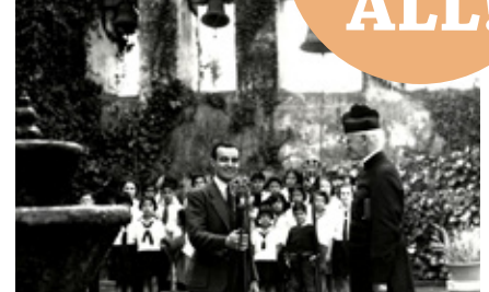
1936 NBC Radio National Broadcast of St. Joseph's Day & Return of the Swallows

Join us virtually for the world-renowned tradition celebrating the annual return of the famous swallows at the historic Mission. We're sorry we are not able to put together an in-person event and gather due to the ongoing pandemic. The Swallows Day Parade has also been cancelled. We hope that by bringing you St. Joseph's Day and Return of the Swallow celebration digitally, you are able to celebrate the swallows returning to Capistrano from wherever you are. We are looking forward to celebrating this continued tradition in person with you in the near future.