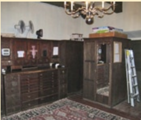
Before ~ October 2003

After three years of continuous conservation efforts, electrical and mechanical upgrades a completed historic Serra Chapel is ready to enter into another 100 years of services.