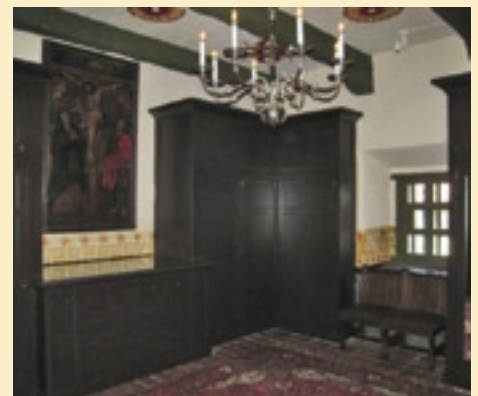
After ~ December 2008

After three years of continuous conservation efforts, electrical and mechanical upgrades a completed historic Serra Chapel is ready to enter into another 100 years of services.