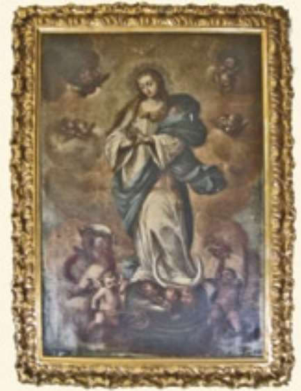
Above image of the artwork within it's frame prior to conservation.

In May, the painting and its frame were removed from the west wall for cleaning and repair. Paintings conservator, Aneta Zebala, who also conserved the Chapel's Stations of the Cross paintings, is performing the treatment. Both the painting and its frame will be returned to the Serra Chapel in July, 2009. It is due to generous gifts by private donors that this painting can be saved.