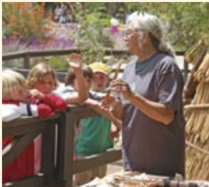
Family Fun Daily