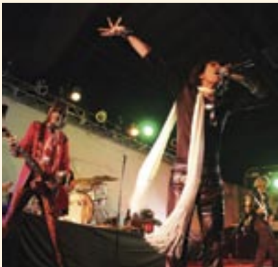
Concerts June through July