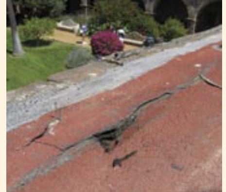
Removal of debris and delapidated roof.

Members planning to visit the Mission this summer should take note that as part of completing the Serra Chapel Conservation Project there are still many improvements to be made.