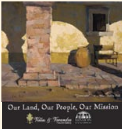
Art Exhibit June 29 – September 29, 2008