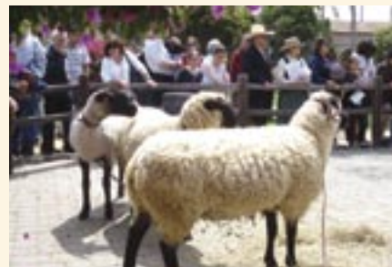
Photo shows the sheep shearing demonstration held on May 10th by Living History Society. Upcoming special events on Living History Day will include wine stomping, on Saturday, September 13.