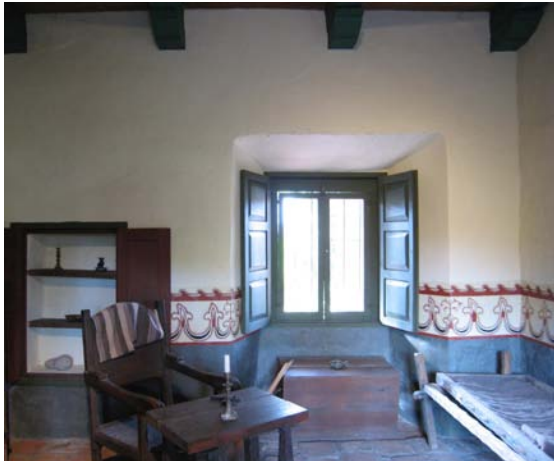
Padre's bedroom before upgrades