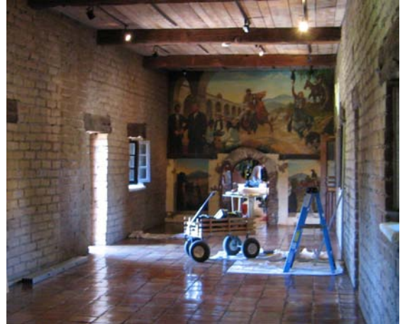
The north end of the Rancho room after all furnishings have been removed and the floors cleaned and sealed.