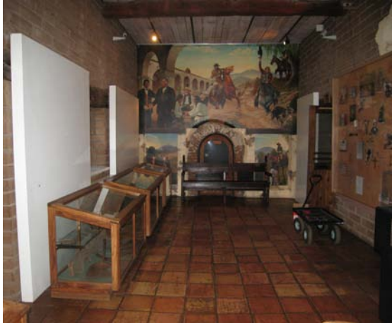
The north end of the Rancho room before the room was cleared.