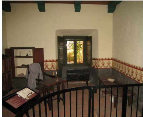
Padre's bedroom after upgrades