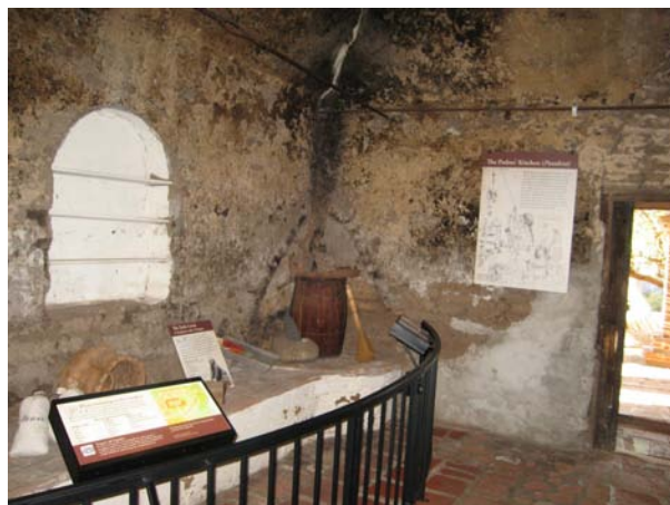
Padre's kitchen after upgrades

Part of the improvements included the addition of replica, mission era props to visual enrich the interpretation found within the panels.