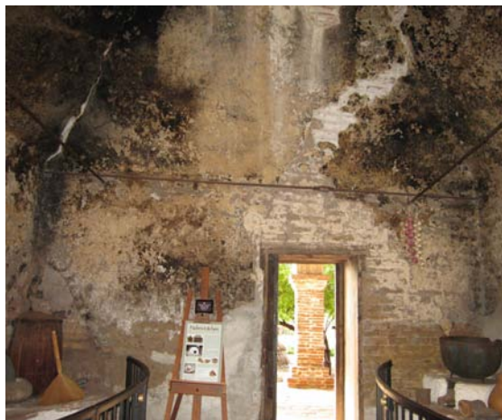
Padre's kitchen before upgrades