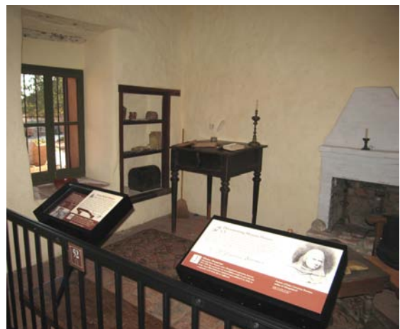
Padre's sitting room after upgrades