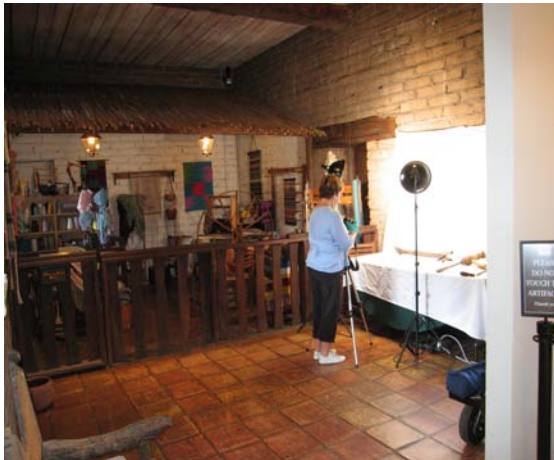
The south end of Rancho room before the room was cleared.