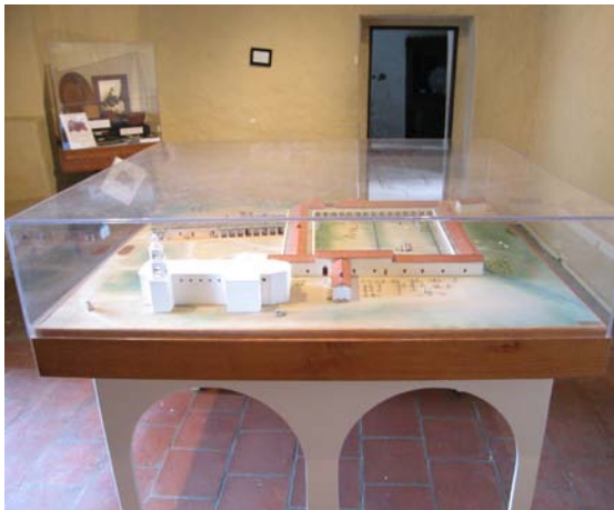
Model room before upgrades

The installation of new signage and museum cases in five of the rooms within the South Wing at the beginning of September concluded several months of work to develop a new interpretation for this wing. The Education and Museum Departments curated the exhibitions working with the Executive Director to provide meaningful site-specific interpretation for audiences of all ages.