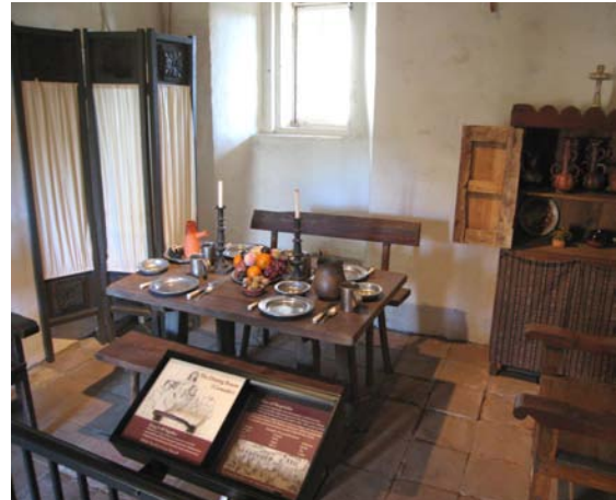
Dining room after upgrades