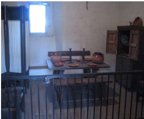
Dining room before upgrades