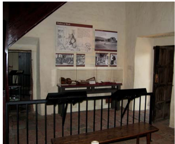
Padre's sitting room after upgrades