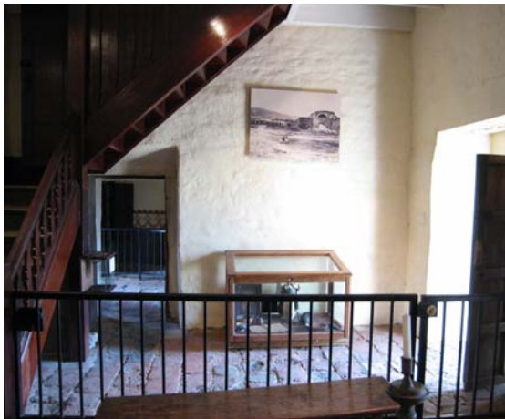
Padre's sitting room before upgrades