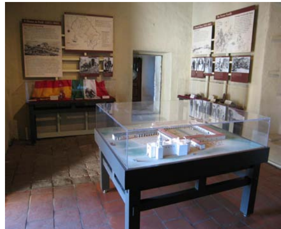
Model room after upgrades