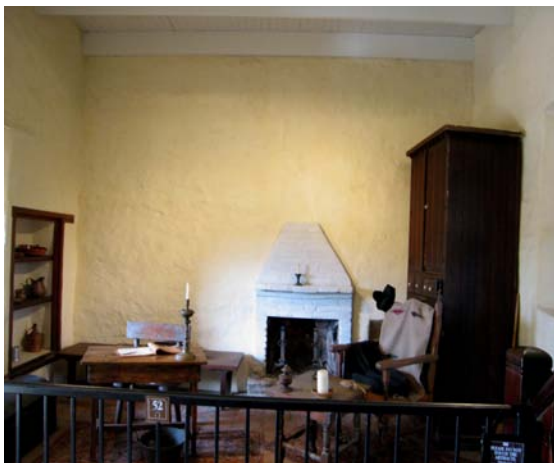
Padre's sitting room before upgrades