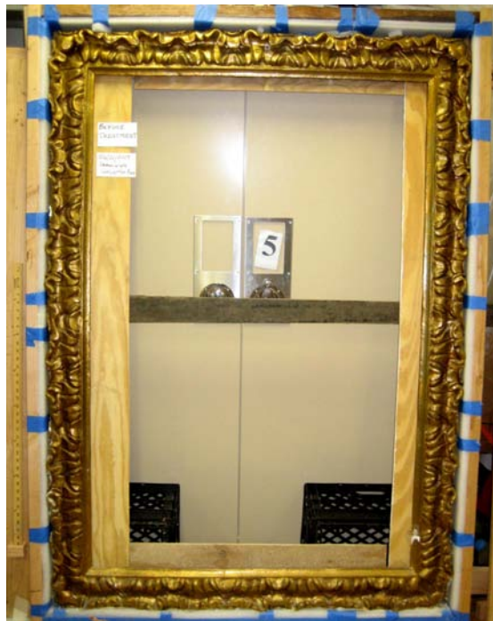
The image on the “left” shows the painting removed from its frame in anticipation for transport to the studio for treatment. The “right” image shows the frame awaiting within a special handling crate built to immobilize it for transportation to the conservation studio.

Paintings conservator Aneta Zebala, who also conserved the Stations of the Cross paintings within the Serra Chapel, is currently performing the treatment. The frame will be conserved and prepared for re-installation by preservation staff in September, 2009.