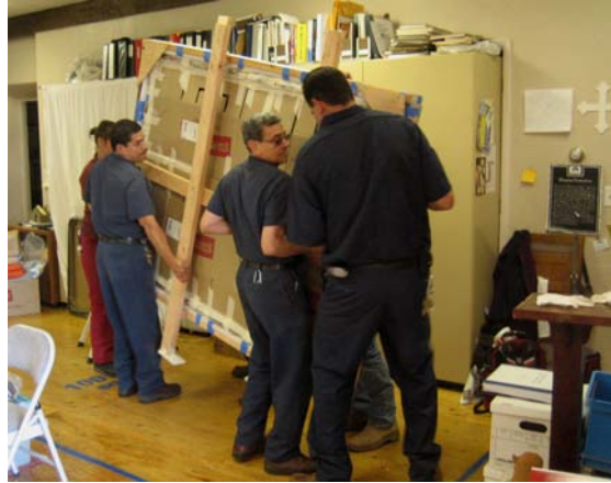
(Left) The frame and painting was accessed and braced during the de-installation process. A wooden support casing was constructed around the plaster frame to immobilize it and prevent breakage during de-installation. (Right) Staff carries the painting and frame into storage for treatment.