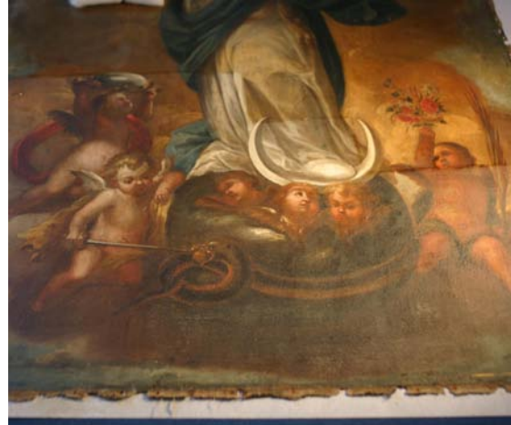
The photo on the “left” shows the lower portion of the unframed painting prior to conservation treatment. The photo on the “right” shows the painting as it undergoes treatment revealing a partially cleaned surface.