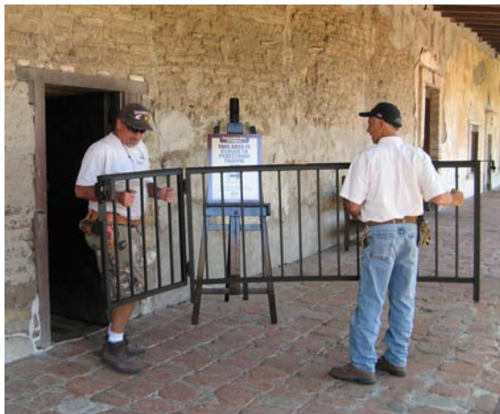
The image on the “left” shows a sampling of artifacts and props to be placed on display. The photo on the “right” shows one of the rails being returned for reinstatement by Universal Exhibits after repairs.