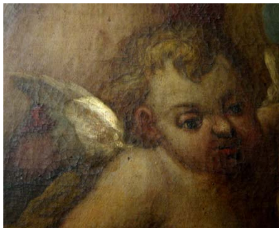
The "left" photo shows the painting and frame. The photo at "right" shows the results of a cleaning test.